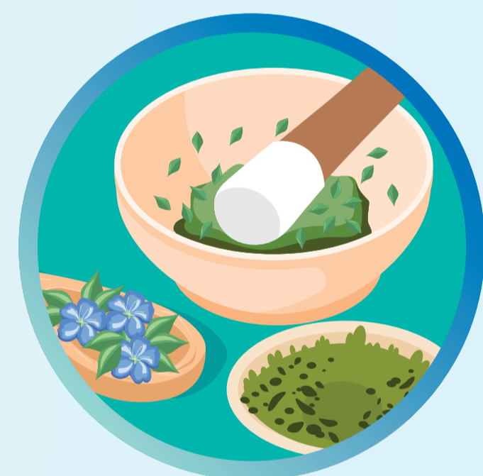
中藥處方 CMs Prescription