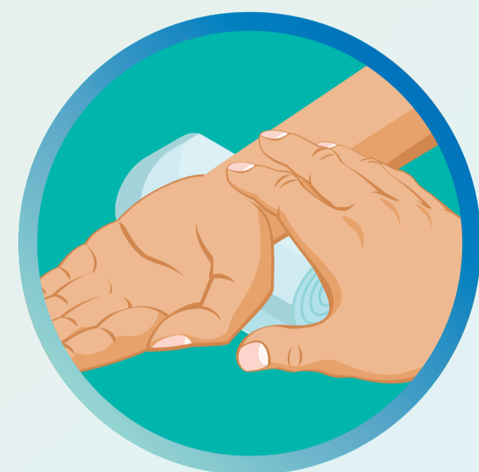
中醫診斷 CM Diagnosis